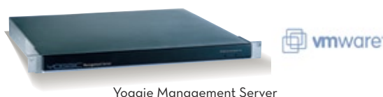
Yoggie Management Server

The optional VMware-based Yoggie Management Server™ monitors and manages the fleet of traveling Gatekeeper Card Pro devices. Installed in the IT server room, it provides security policy updates, signatures, and rule-base updates, while obtaining local logs and events for complete visibility. Gatekeeper Card Pro settles the conflict between the user's desire for the freedom and the IT manager's concern for security. The laptop's connection to the Internet is disabled unless the Gatekeeper Card Pro is plugged-in. Finally, the security of the entire corporate workforce, both inside and outside the network, can be centrally managed and enforced by the IT organization.